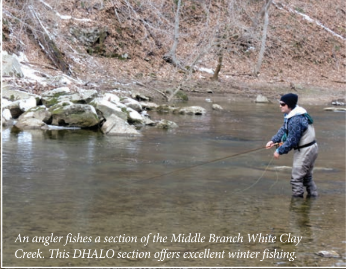
An angler fishes a section of the Middle Branch White Clay Creek. This DHALO section offers excellent winter fishing.