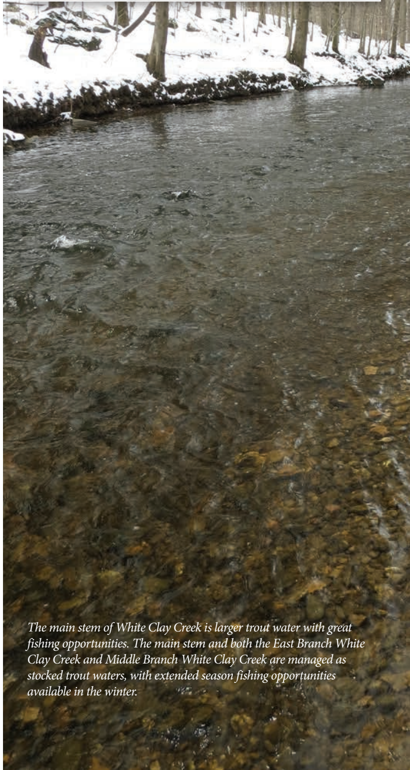
The main stem of White Clay Creek is larger trout water with great fishing opportunities. The main stem and both the East Branch White Clay Creek and Middle Branch White Clay Creek are managed as stocked trout waters, with extended season fishing opportunities available in the winter.