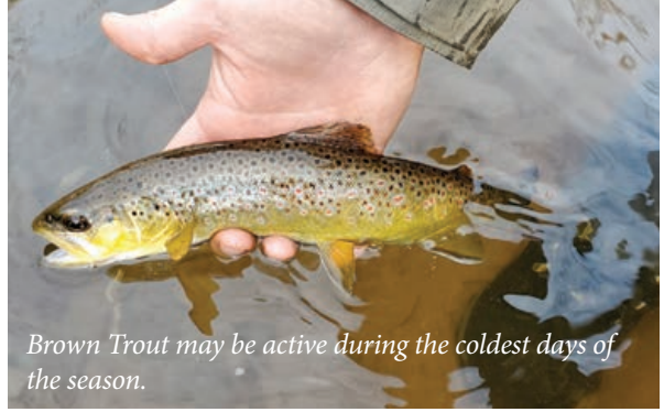
Brown Trout may be active during the coldest days of the season.

stream is part of the Keystone Select Stocked Trout Waters program. Under the program, 2- to 3-year-old trout, measuring between 14- to 20-inches, are spread among select waters under the DHALO regulations. Anglers should keep their eyes open for these bigger trout in the creek. Bring along a good net in case you hook up with one.